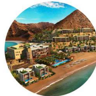
SARAYA BANDAR JISSAH