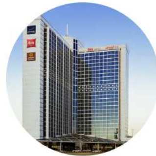
NOVOTEL & IBIS HOTEL