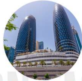
DAMAC PARK TOWERS