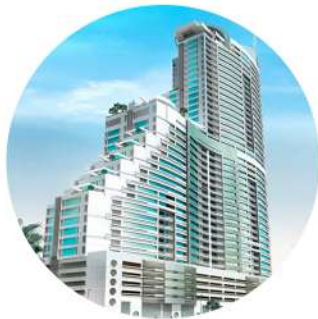
AL JABER TOWER