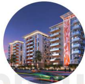
DAMAC CELESTIA APARTMENTS