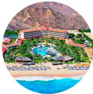
ROTANA AL AQAH