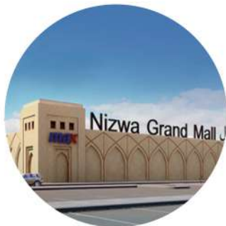
NIZWA GRAND MALL