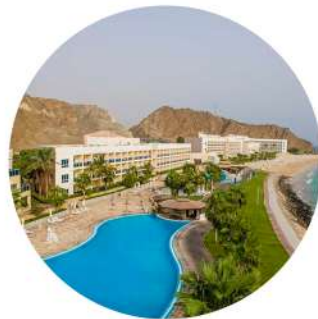
RADISSON BLU - DIBBA