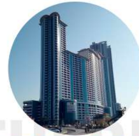
AJMAN CORNICHE RESIDENCE