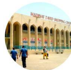
MADINAT ZAYED SHOPPING CENTRE & GOLD CENTRE