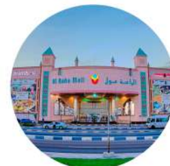
AL RAHA MALL