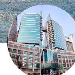
ABU DHABI MALL