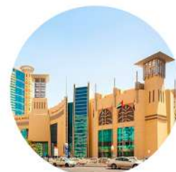
AL WAHDA MALL