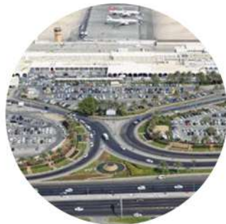
INFLIGHT CATERING MC13

OUR SUBSIDIARY AL AMER ENGINEERING CO. L.L.C. (AIGESCO)