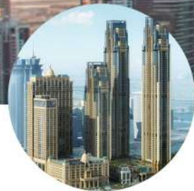
AL HABTOOR CITY