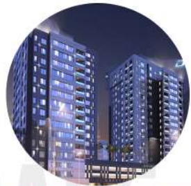
DAMAC EXECUTIVE BAY