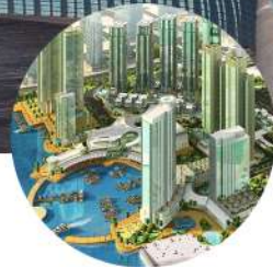
AL REEM ISLAND