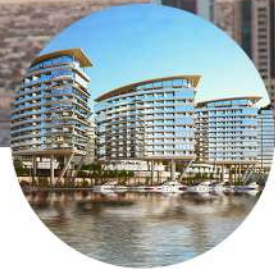
DUBAI JEWEL CREEK