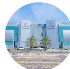
AL FOAH MALL