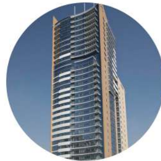
NOUR ARJAAN BY ROTANA