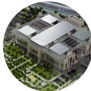
ROYAL OMAN POLICE GENERAL HOSPITAL