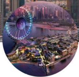
DUBAI BLUE WATERS