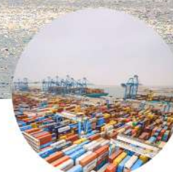
ABU DHABI PORTS ICAD, MUSAFFAH, AND KIZAD