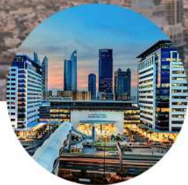
DUBAI WORLD TRADE CENTER