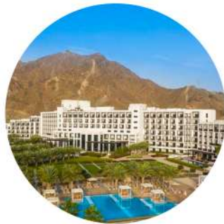
INTERCONTINENTAL AL AQAH