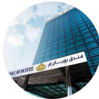
ROYAL M HOTEL